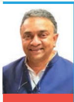
DIRECTOR OF PROCEEDINGS