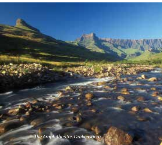
The Amphitheatre, Drakensberg.

Visits to at least two sites of historical and environmental interest are included in the programme, and visits to other places of interest are part of individual courses.