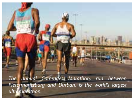
The annual Comrades Marathon, run between Pietermaritzburg and Durban, is the world's largest ultramarathon.