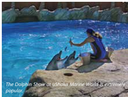
The Dolphin Show at uShaka Marine World is extremely popular.

Application deadline: Please note that the deadline for applications is 31 May 2015.