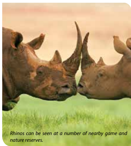
Rhinos can be seen at a number of nearby game and nature reserves.